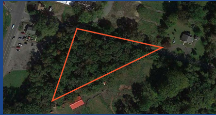
664 Bridgeton Pike