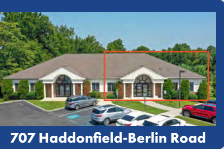
707 Haddonfield-Berlin Road