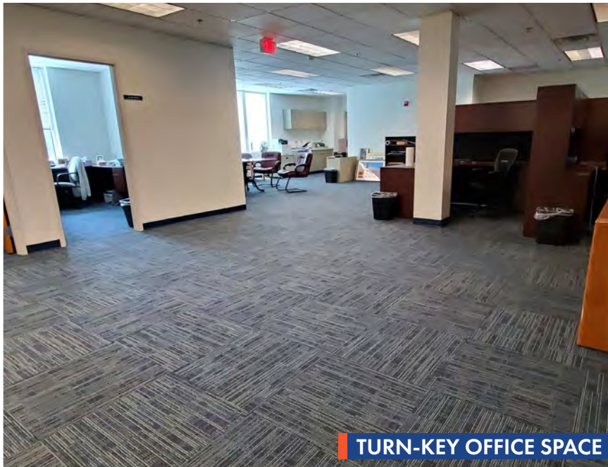
TURN-KEY OFFICE SPACE