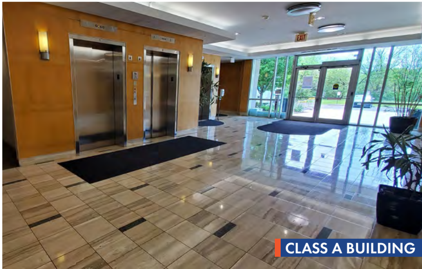
CLASS A BUILDING