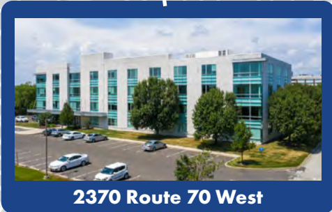
2370 Route 70 West