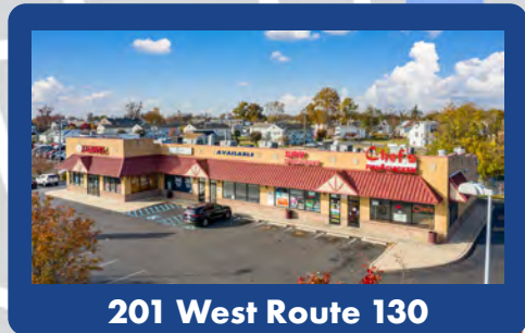
201 West Route 130