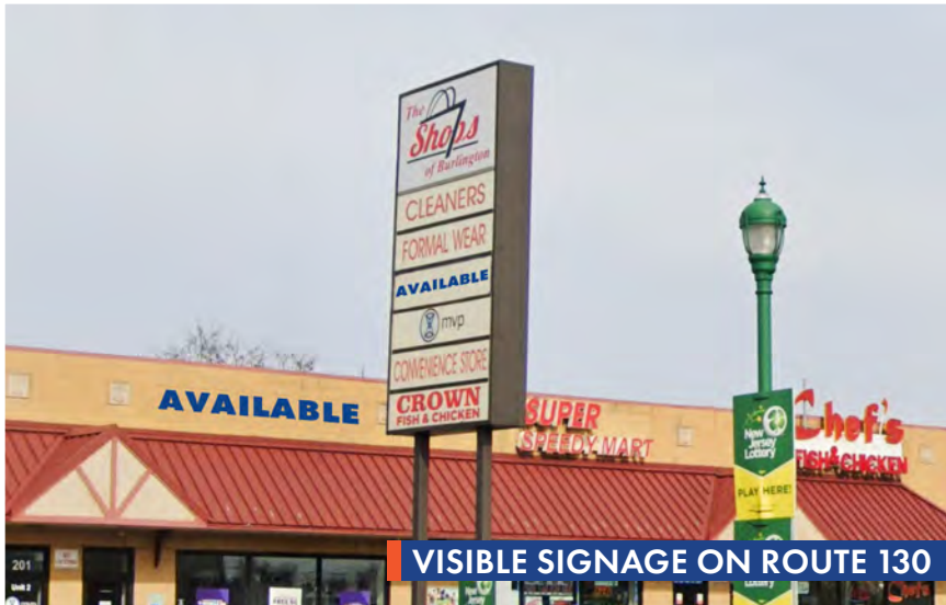
VISIBLE SIGNAGE ON ROUTE 130