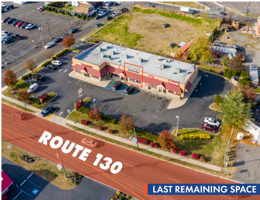
LAST REMAINING SPACE