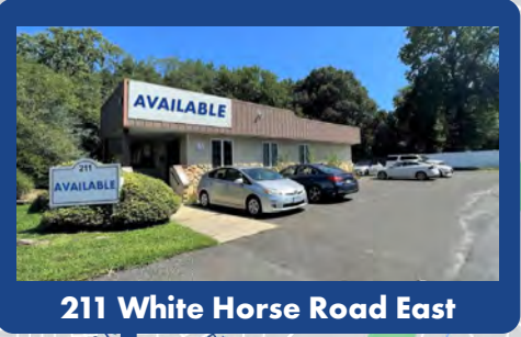
211 White Horse Road East