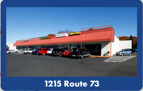
1215 Route 73