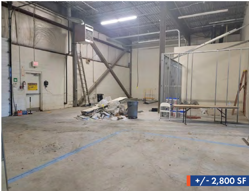
+/- 2,800 SF