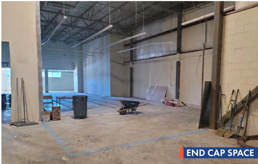
END CAP SPACE