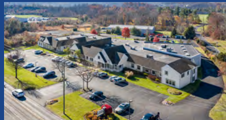
2288 2nd Street Pike