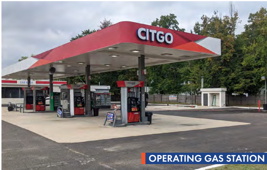
OPERATING GAS STATION