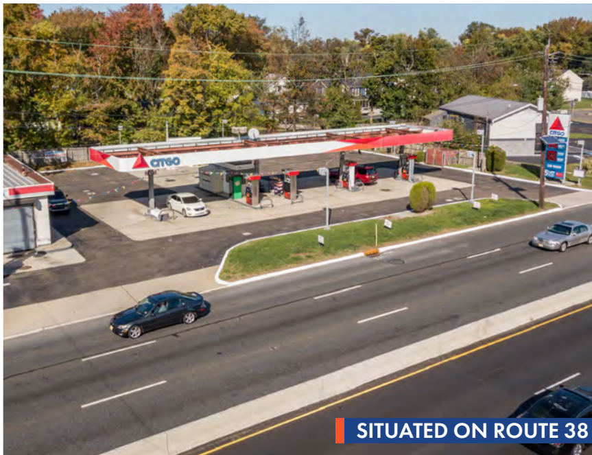
SITUATED ON ROUTE 38